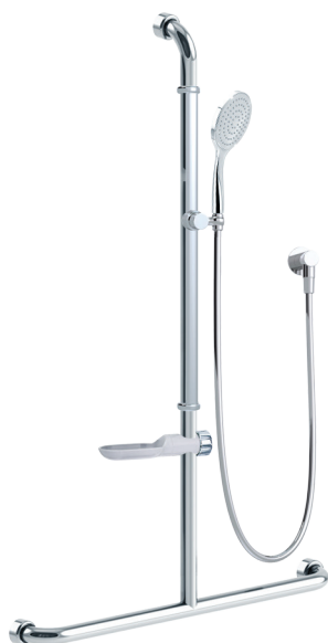
Drawn MF (Middle Fix)